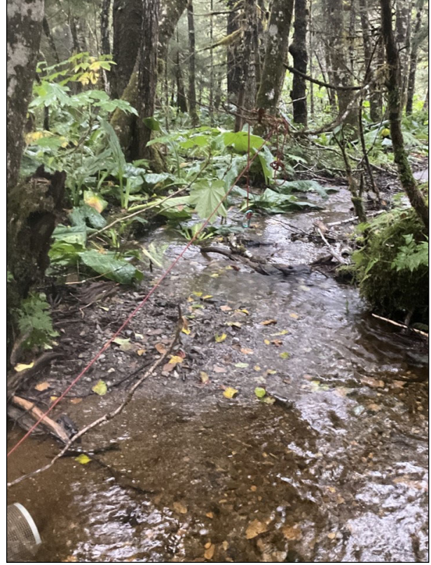
Figure 2.—Downstream view of channel at waypoint 1626.