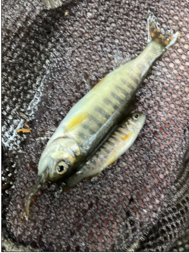
Figure 1.— Juvenile coho salmon captured at waypoint 1626.