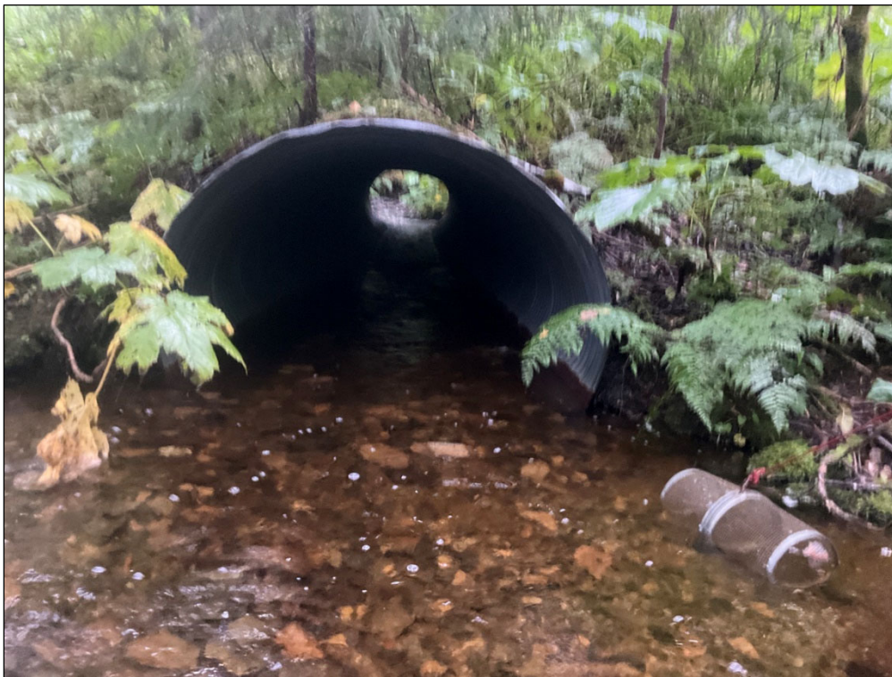
Figure 3.—Culvert outlet at waypoint 1626.